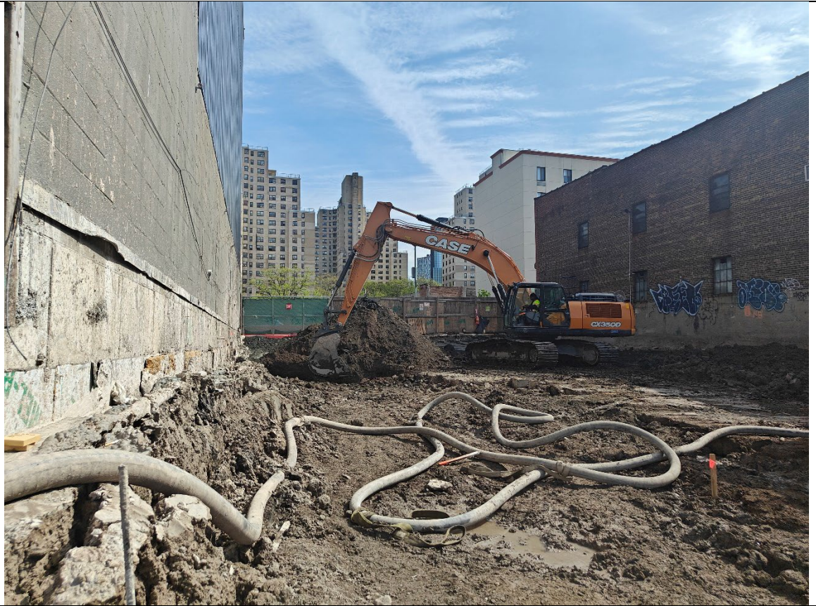
Photo 4- Representative photo of the Site nearing the end of days activities.