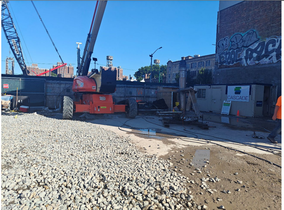
Photo 2- Representative photo of site at the end of the days activities.