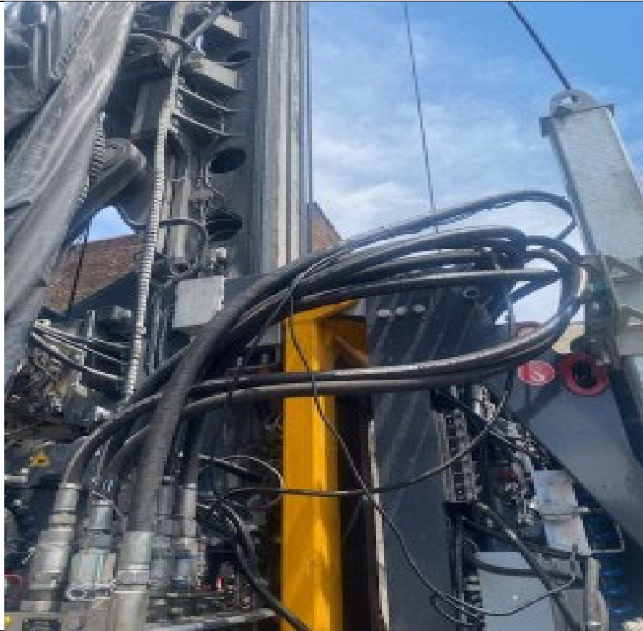
Photo 4- Representative photo of Kelly- bar hoisted into position to reattach to KDK on drill-rig.