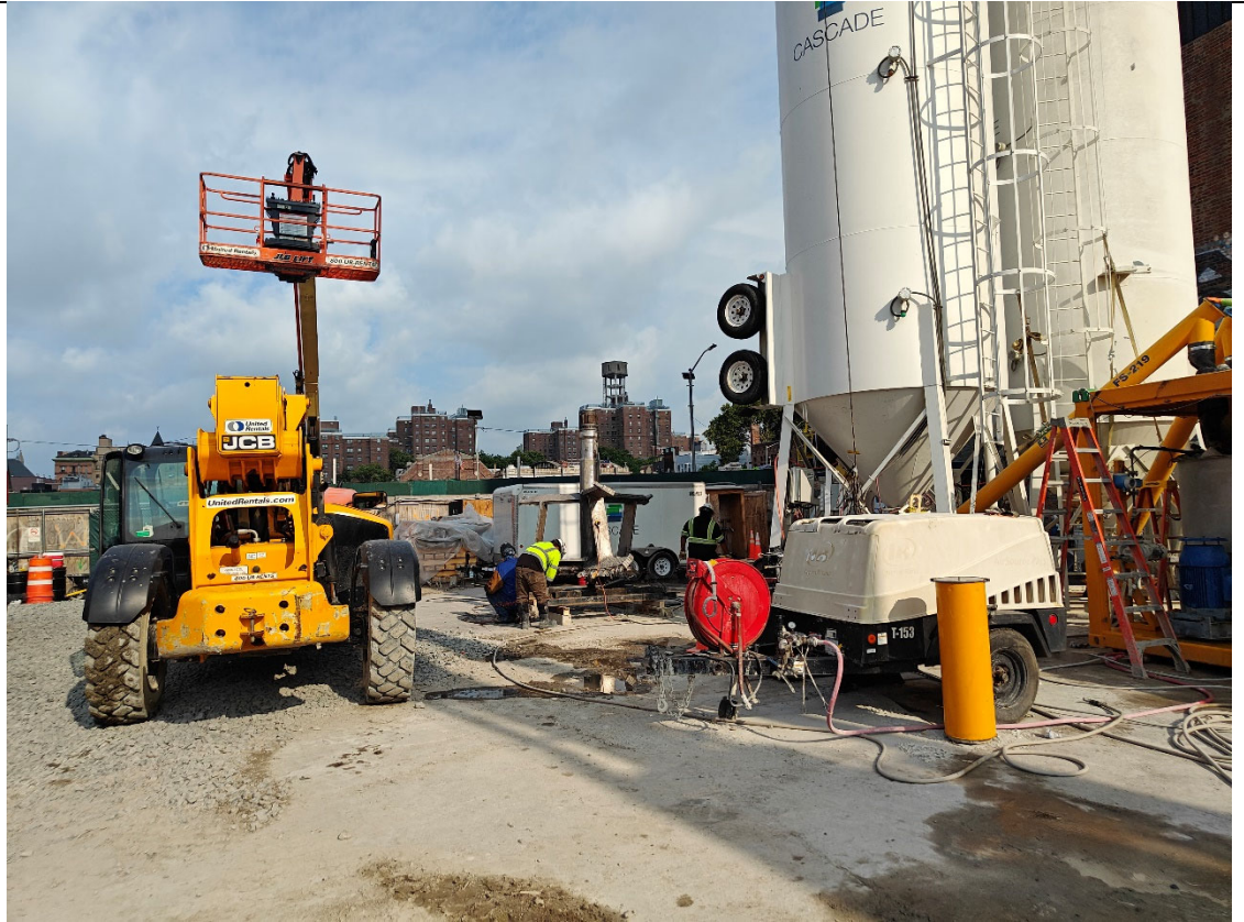
Photo 4- Representative photo of batch plant maintenance.