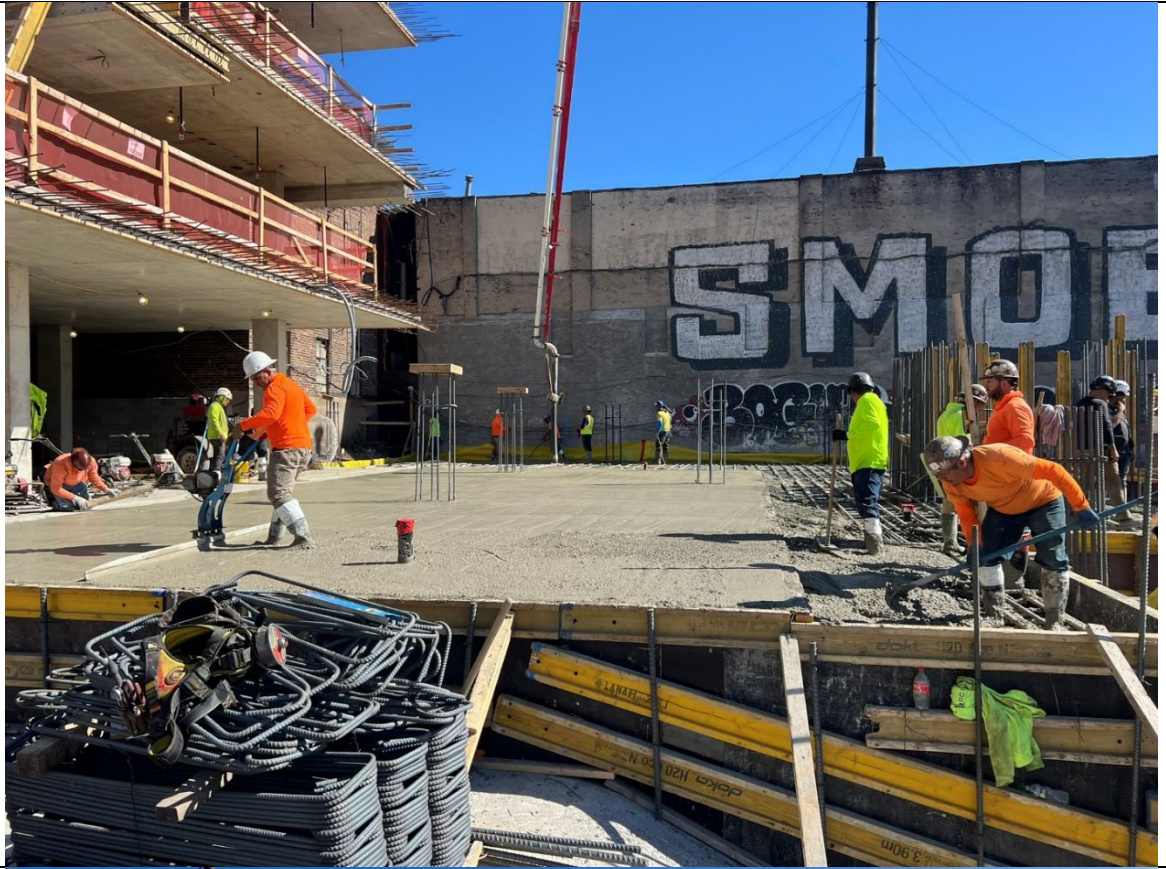
Photo 4- Representative photo of finishing concrete pour for the day.