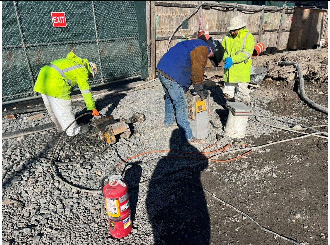
Photo 2- Representative Photo of utility vault work.