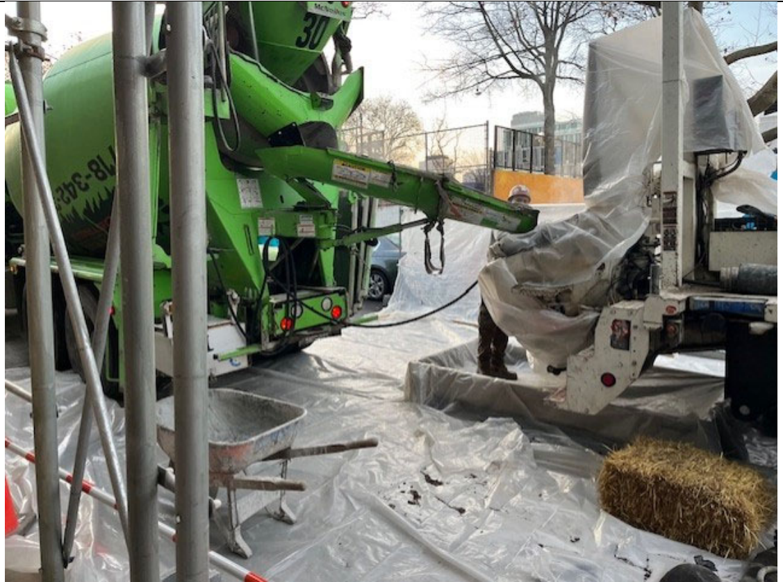
Photo 2- Representative photo of concrete pump setup.