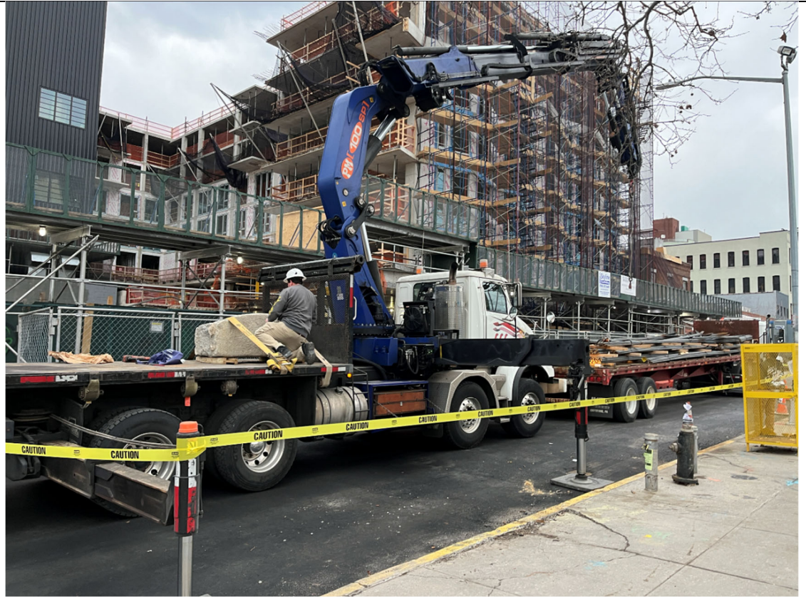
Photo 2- Representative photo of the site facing southwest.