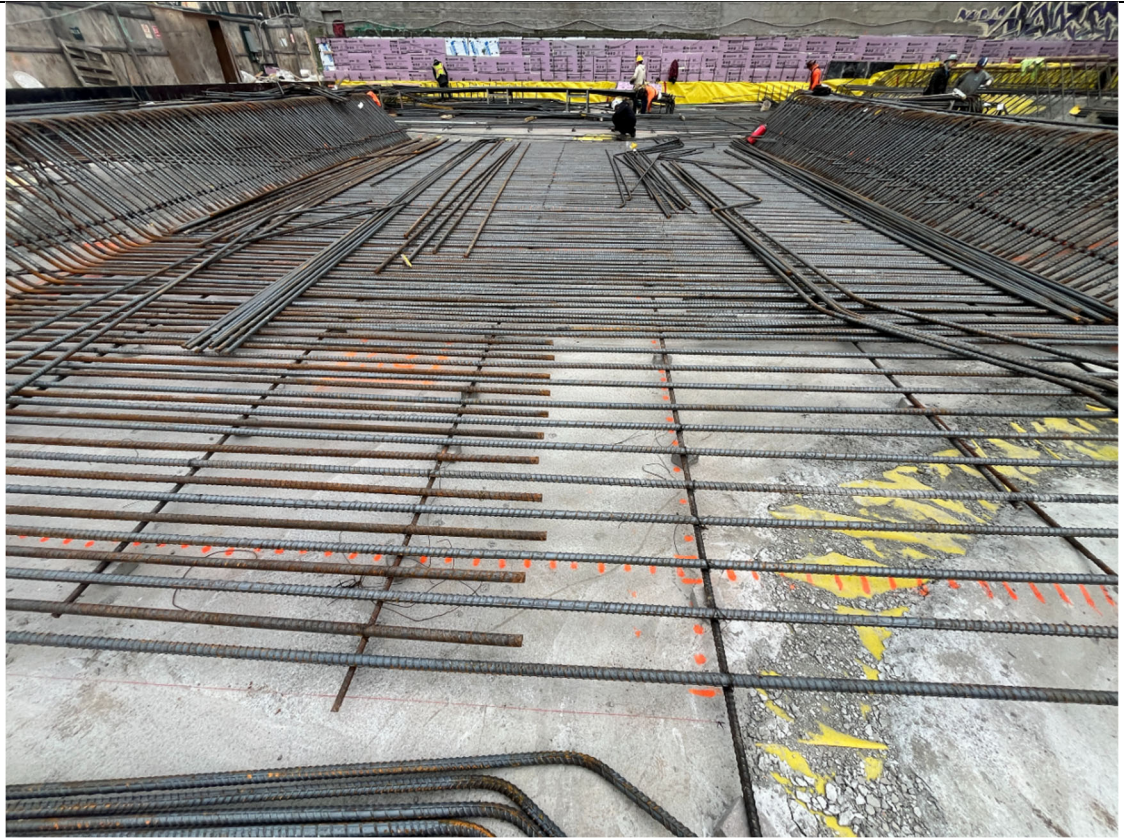
Photo 4- Representative photo of the Phase II superstructure.