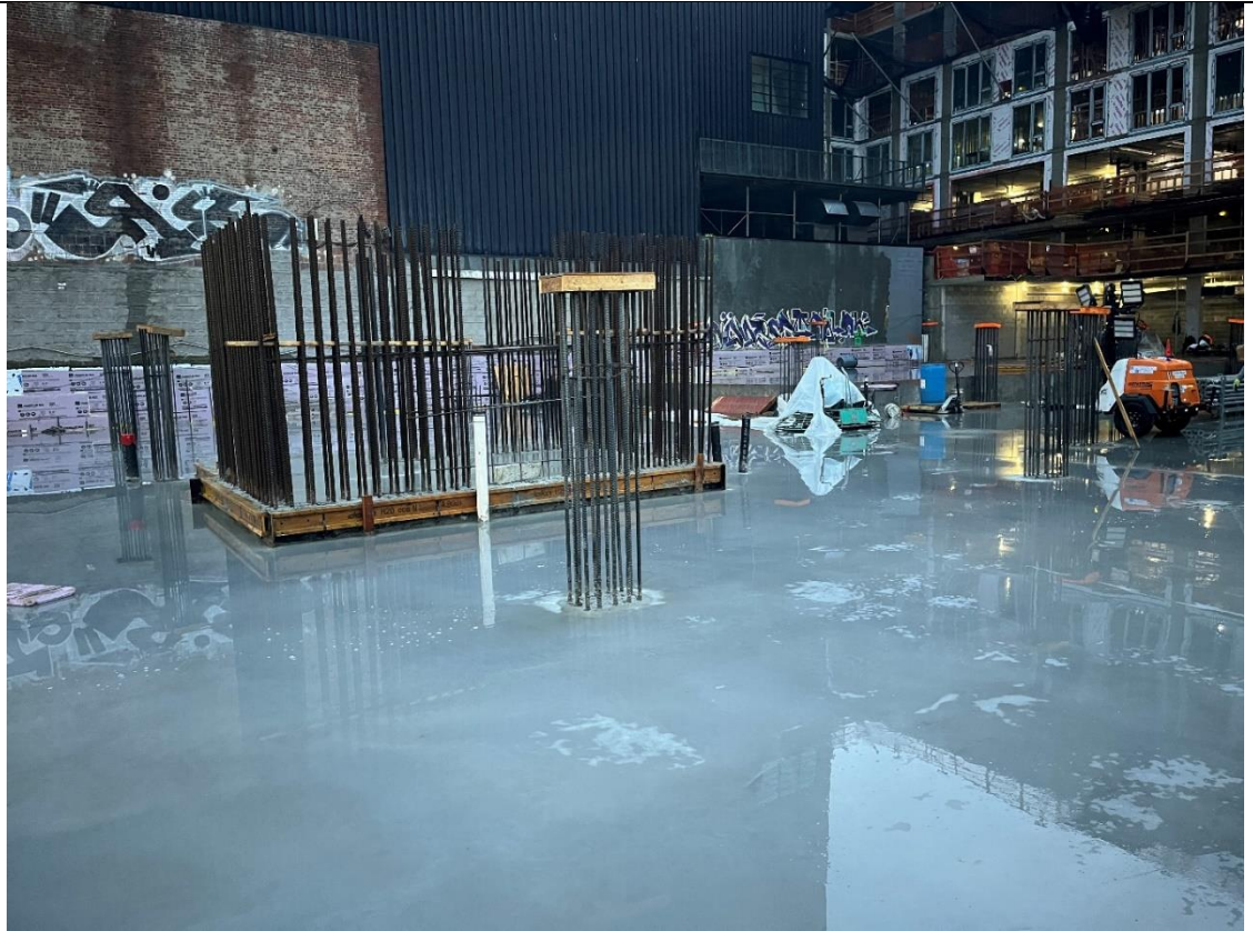
Photo 2- Representative photo of super structure work.