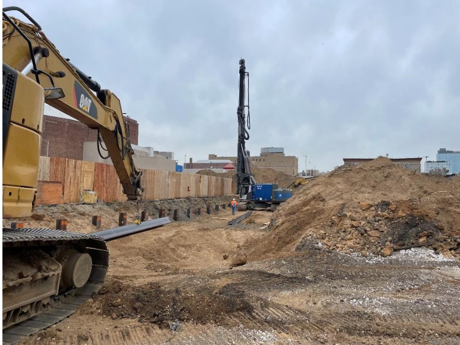
Photo 1: View of contractor installing H piles in Lot 14, facing north-northwest.