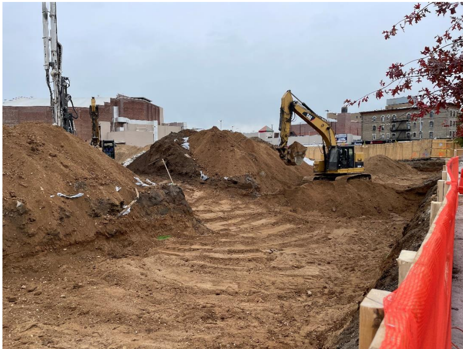
Photo 2: View of excavation for SOE installation along the perimeter of Lot 14, facing north.