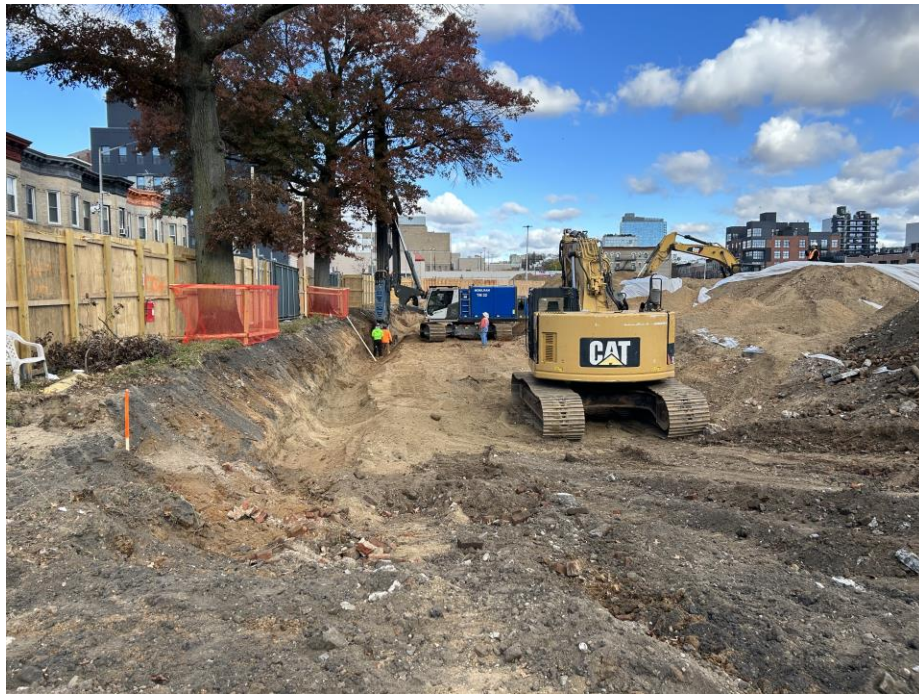
Photo 2: View of H piles and lagging installation in Lot 14, facing north-northwest.