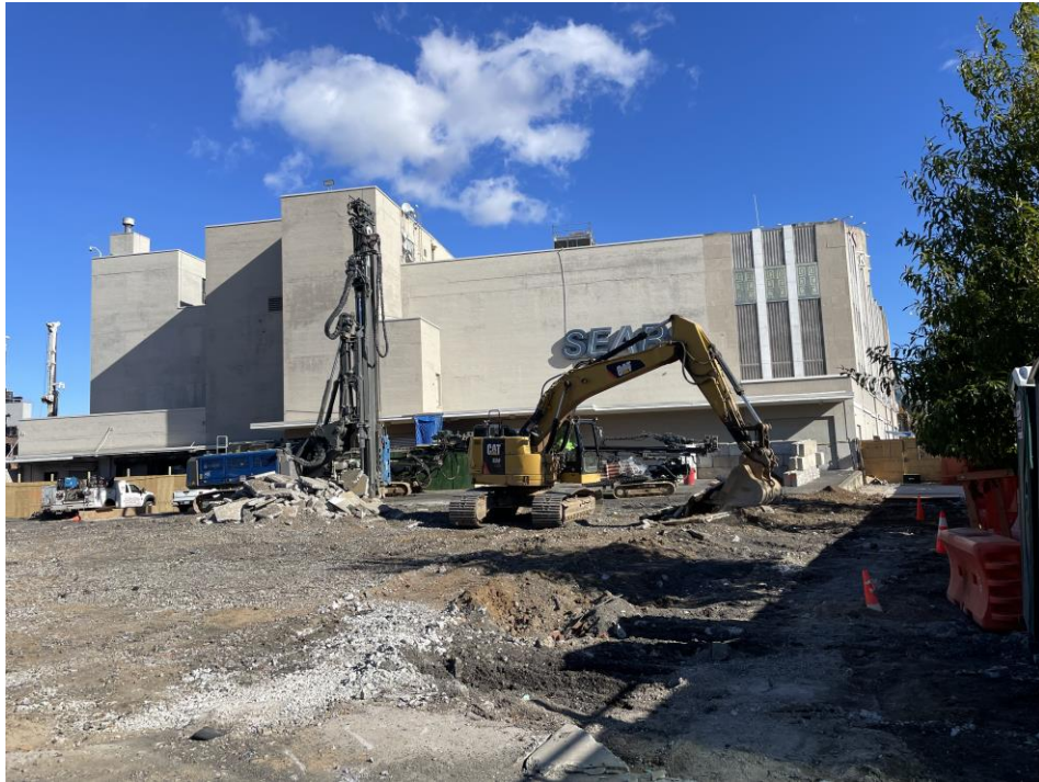
Photo 1: View of asphalt and concrete stripping in Lot 14, facing east.