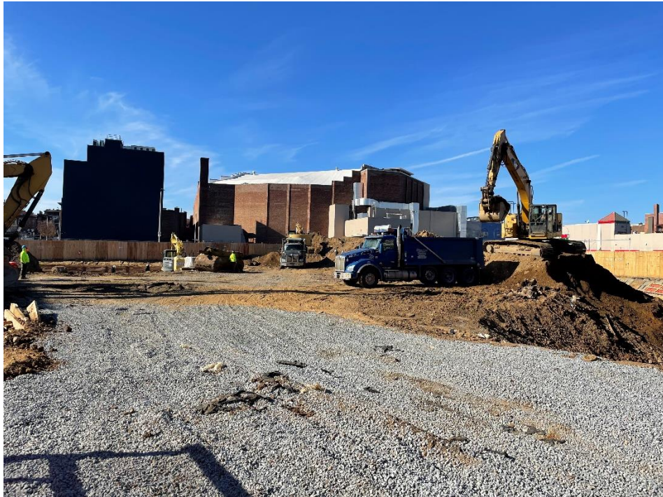
Photo 2: View of stabilized truck pad entrance, facing west-northwest.