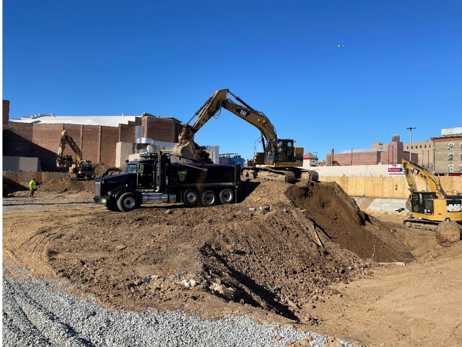
Photo 1: View of contractor loading soil in Lot 14, facing northwest.