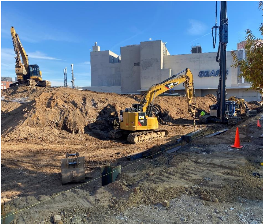
Photo 2: View of contractor installing H piles in Lot 14, facing east.