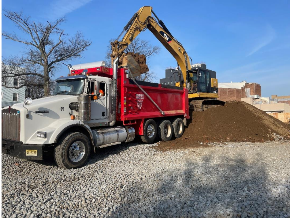
Photo 1: View of contractor loading soil on Lot 14, facing west-northwest.