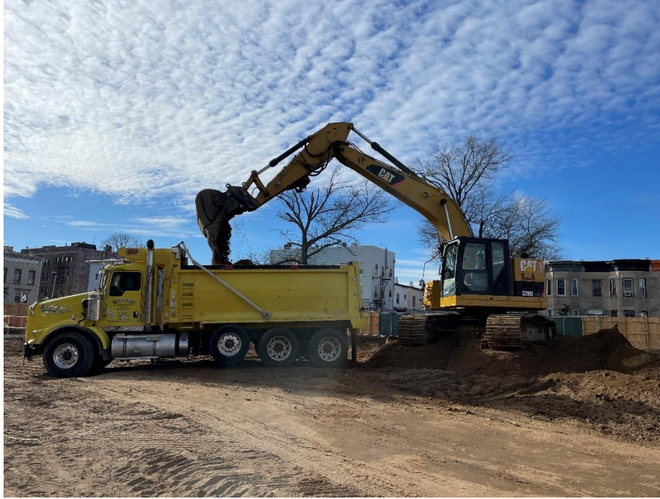
Photo 1: View of contractor loading soil on Lot 14, facing southwest.