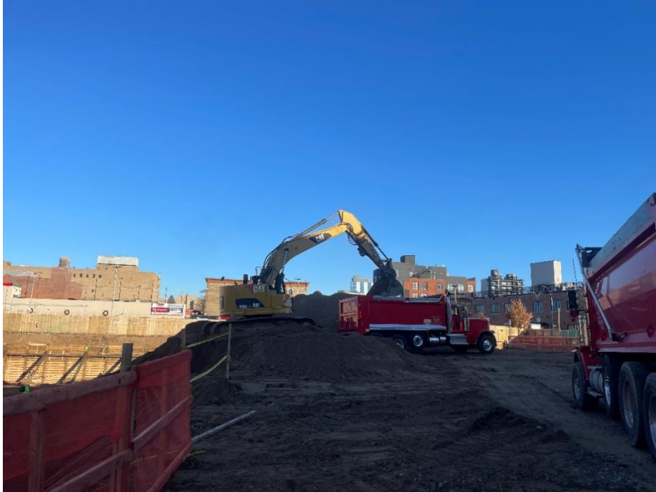
Photo 1: View of contractor loading soil for off-site disposal on Lot 14, facing northeast.