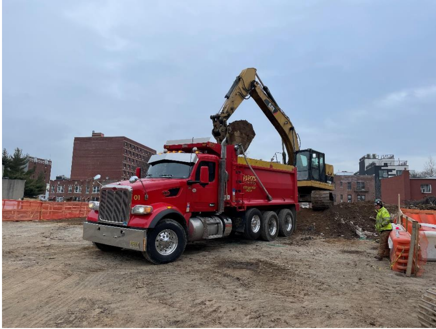
Photo 1: View of soil loading for disposal on Lot 53, facing east.