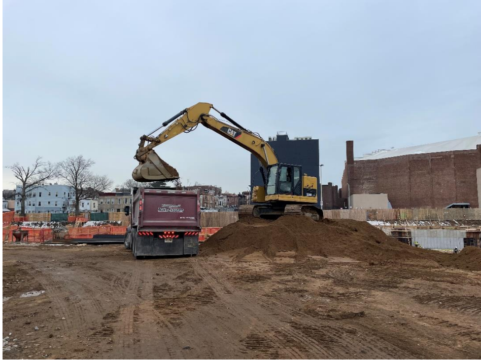
Photo 1: View of contractor loading soil on Lot 14, facing south-southwest.