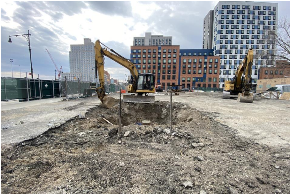
Photo 1: View of RYC Turbos Corp. excavating non-hazardous soil/fill in the southeastern part of the site (facing west).