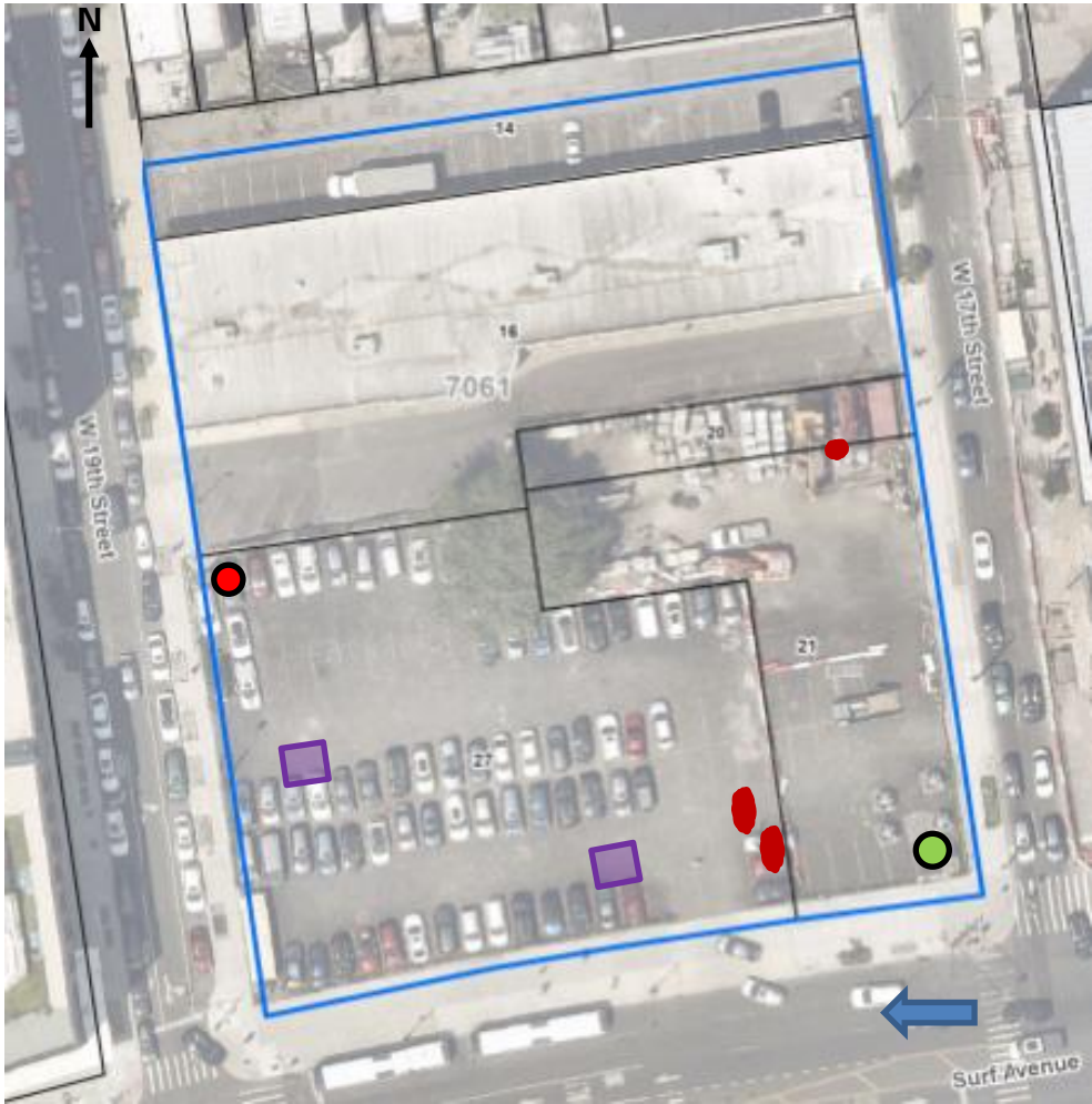
FIGURE 1: SITE PLAN