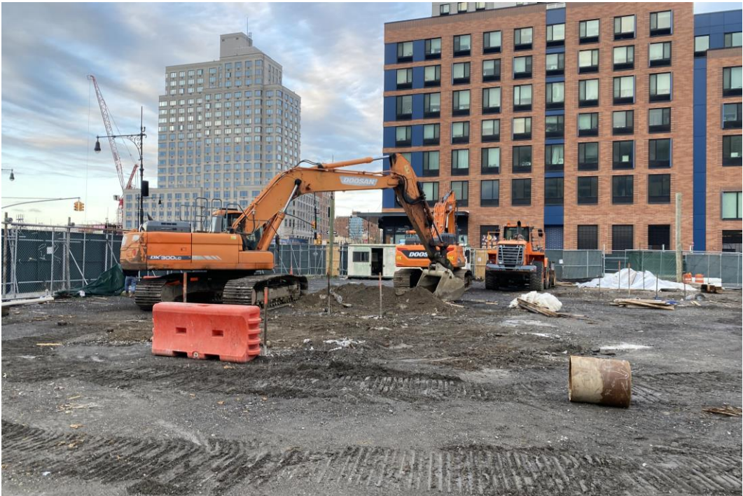
Photo 1: View of Precise grading in the southeastern part of the site (facing west).