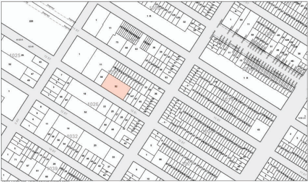
Department of Finance Digital Tax Map