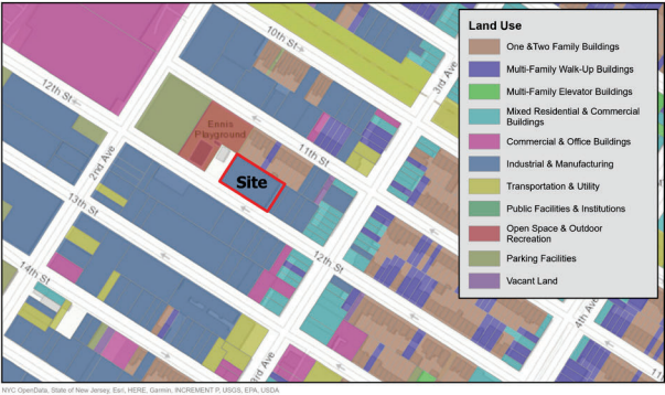
Department of City Planning MapPluto 2023 v1