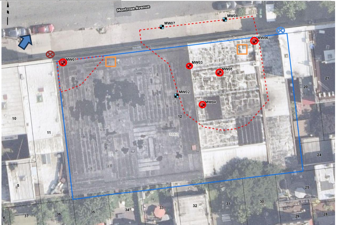
Figure 1: Monitoring Well Location Map