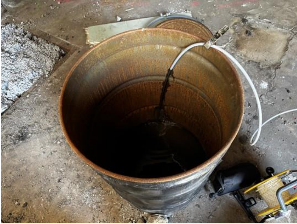
Photo 1: View of EPhase 2 developing monitoring well MW05 into a 55-gallon drum (facing down).