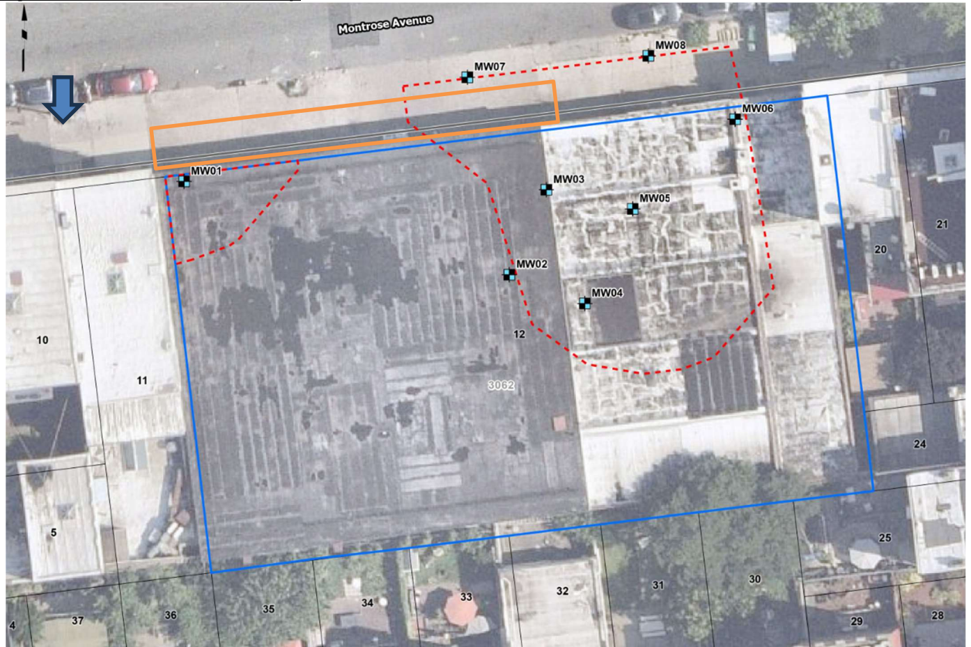
Figure 1: Work Area Location Map