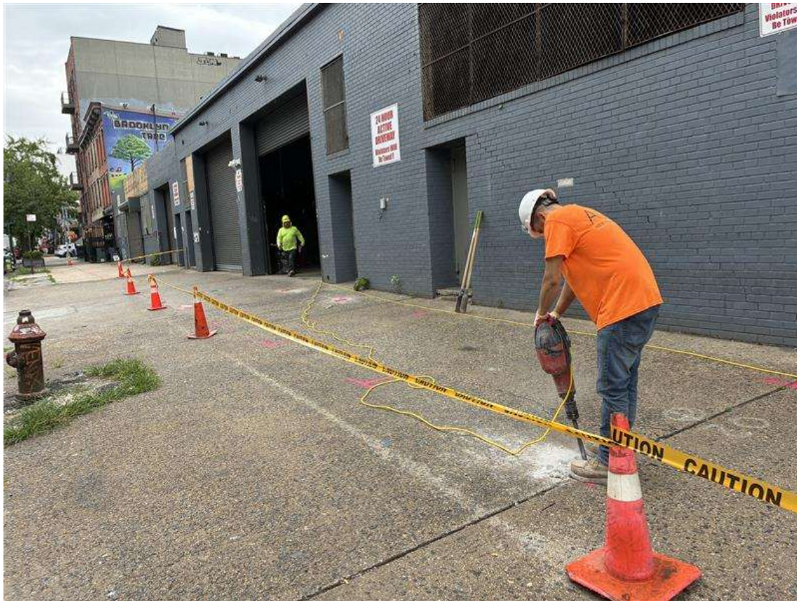
Photo 1: View of fence installation setup work in sidewalk along Montrose Ave (facing southeast).