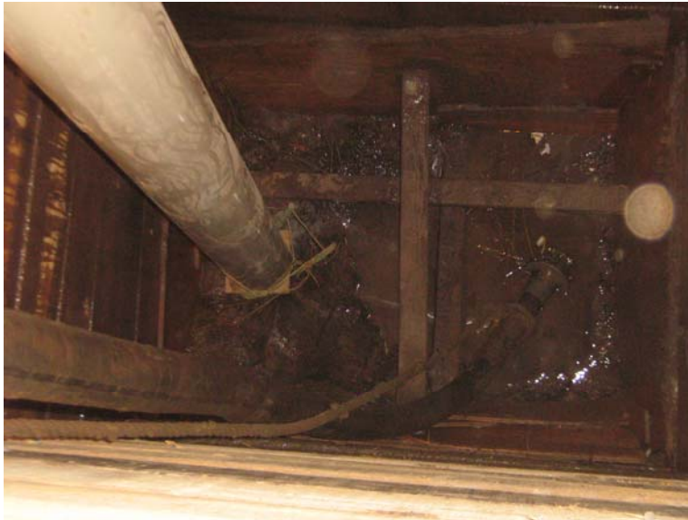
1. Pier # 11 Exposed bedrock, after additional hand cleaning, just prior to concrete installation