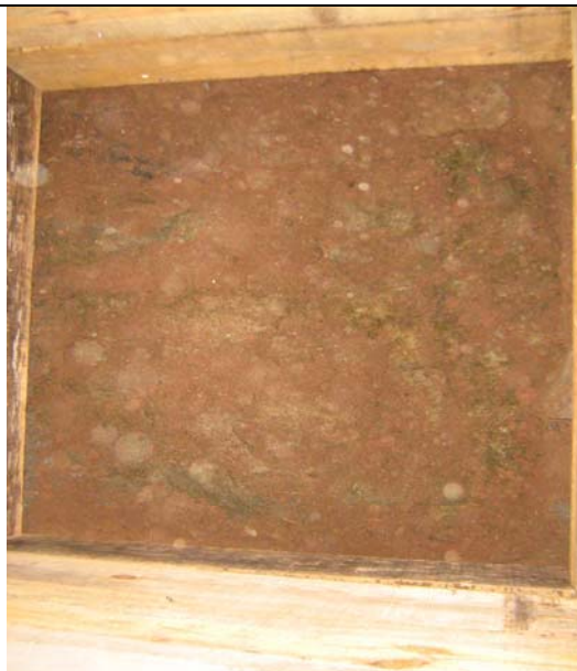
2. Pier #5 Exposed bedrock, prior to concrete installation