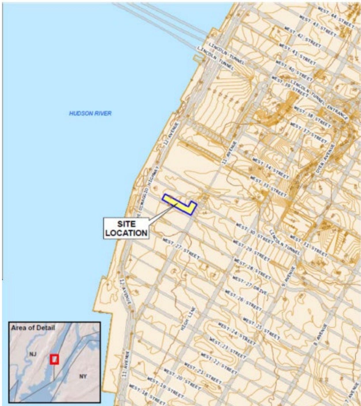
EXHIBIT A SITE MAP