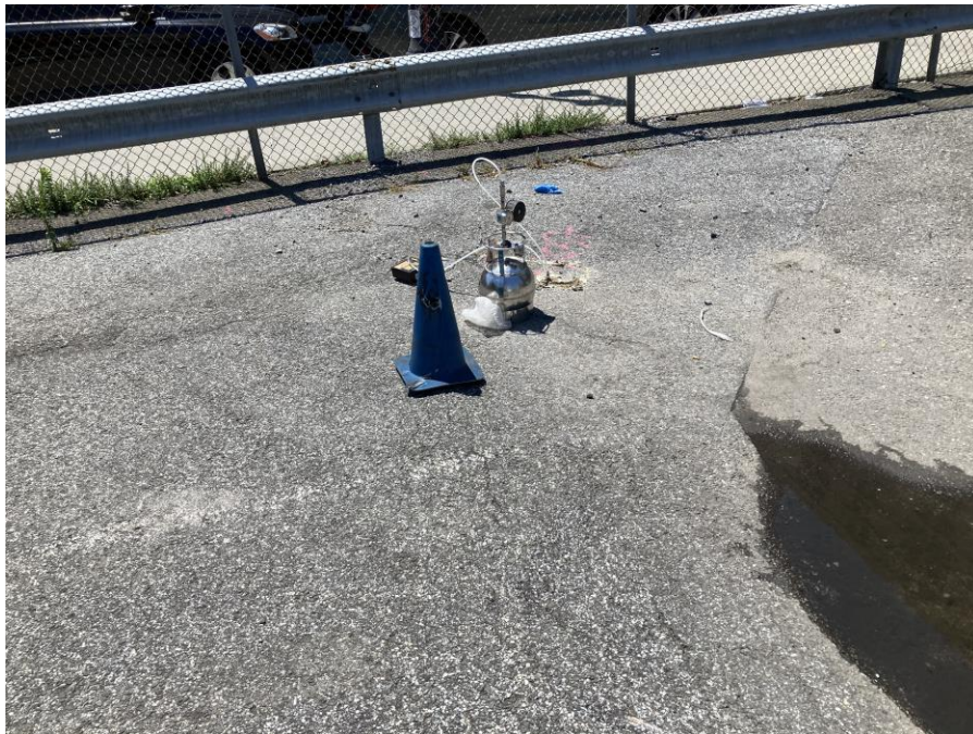
Photo 3: View of soil vapor sampling equipment at SV-37 (facing south)