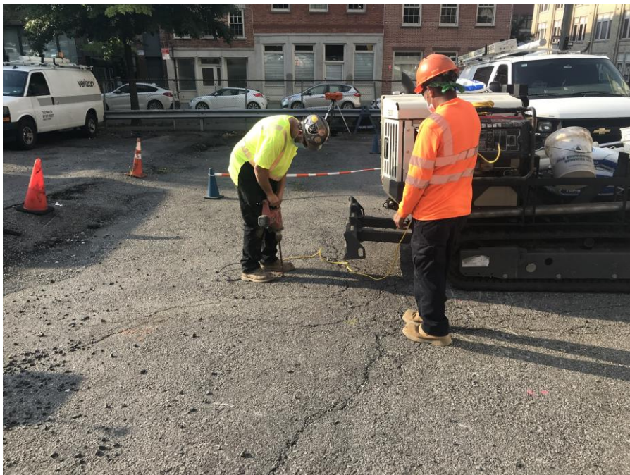
Photo 2: AARCO installing sub-slab vapor probe at Void 1 (facing south)