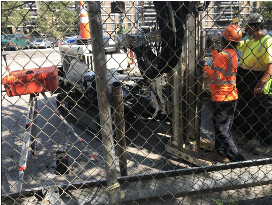
Photo 1: AARCO installing a soil vapor probe at SV-28 (facing north)