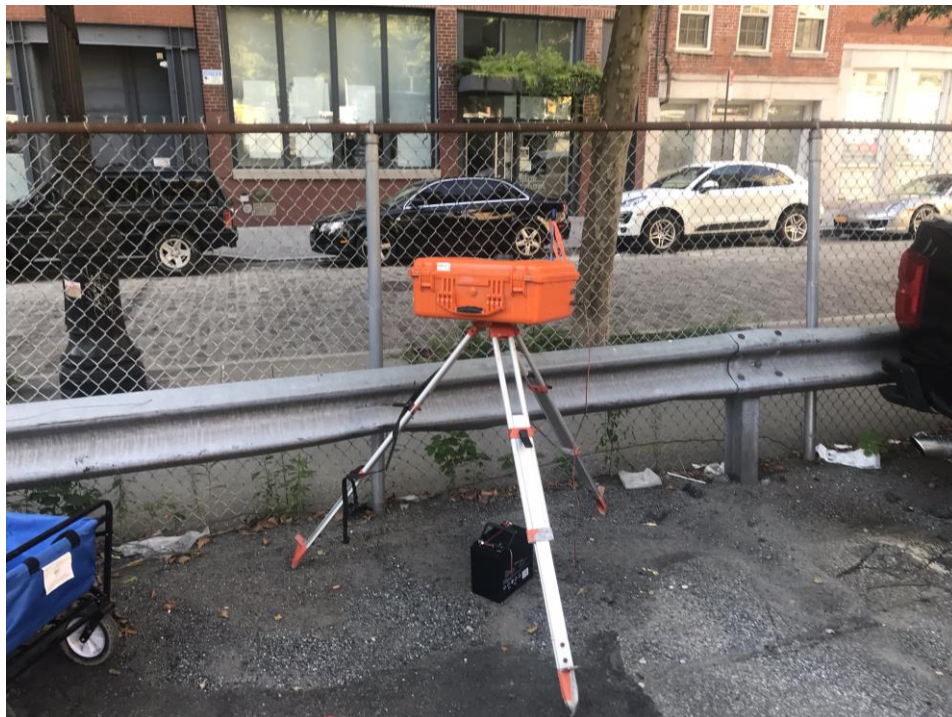
Photo 4: Perimeter CAMP station PM-4 in the southern part of the site (facing south)

Cc: J. Yanowitz, P. McMahon, M. Raygorodetsky