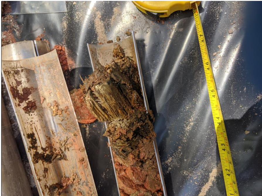
Photo 4: View of wood found at refusal depth at boring SB16 (facing northwest)