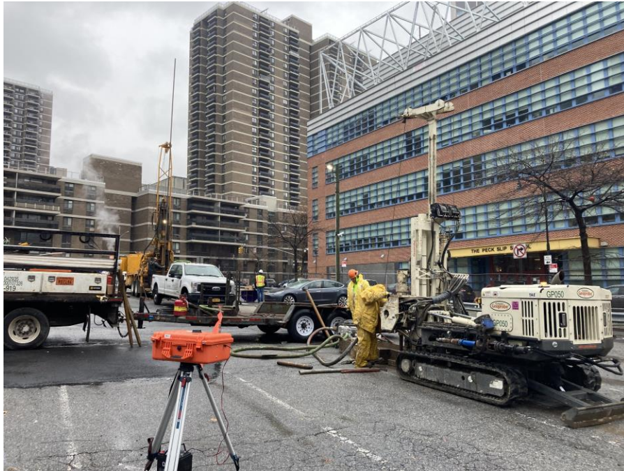
Photo 1: View of AARCO drilling at LB-6 and LB-11 (facing northeast).