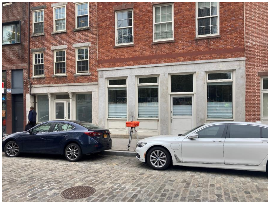
Photo 2: View of perimeter CAMP station PM-3, relocated to the southern sidewalk of Water Street (facing south)