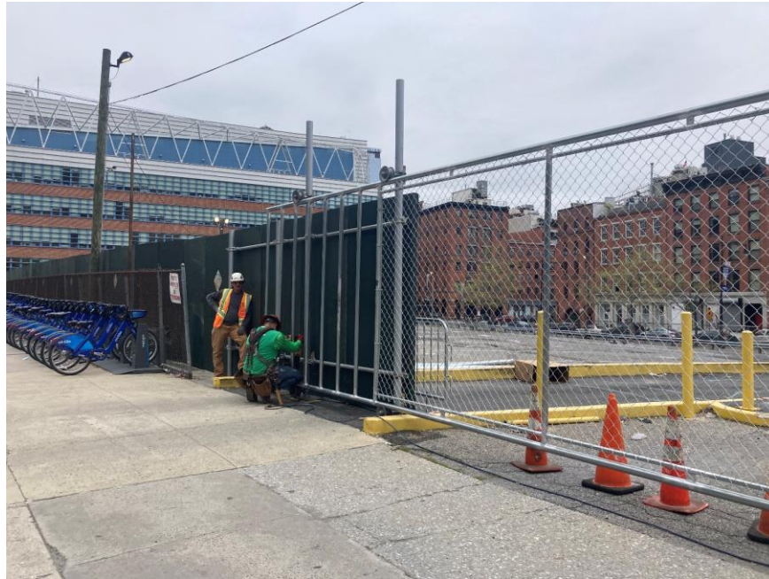
Photo 1: View of perimeter construction fencing installed along the northern boundary of the site (facing southeast).