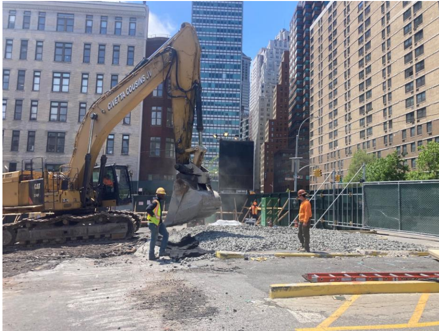
Photo 1: View of CCJV grading previously imported 2.5-inch virgin stone for maintenance of the tracking pad in the northwestern portion of the site (facing west)