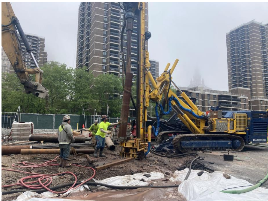
Photo 2: View of CCJV advancing a foundation pile in the southwestern portion of the site (facing southwest)