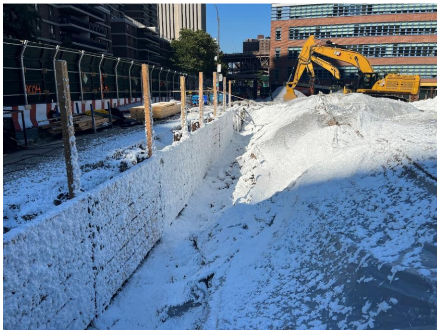
Photo 2: Installed timber lagging sprayed with Atmos® AC-645 dust/vapor suppressing foam and stockpiled soil/fill covered with polyethylene sheeting along the northern boundary of the site (facing east).