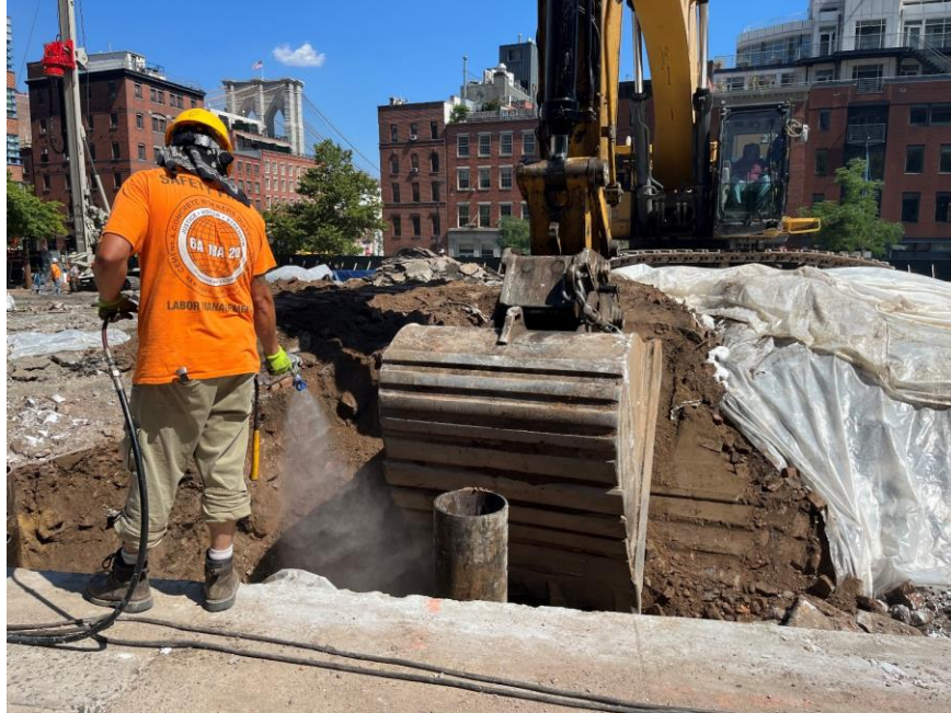
Photo 1: CCJV excavating soil/fill along the northern boundary of the site and actively applying Mercon-X® to the excavation area (facing southeast)