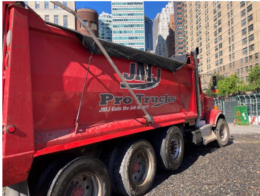
Photo 1: View of a truck secured with a tight-fitting cover prior to exiting the site (facing northwest)