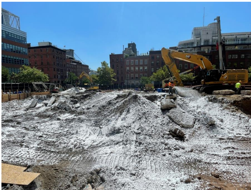
Photo 2: CCJV applying Atmos® AC-645 dust/vapor suppressing foam to exposed soil/fill in the eastern part of the site (facing west)