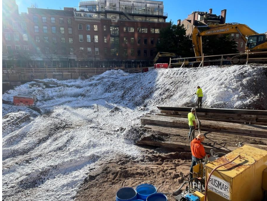
Photo 1: CCJV applying Atmos ® AC-645 dust/vapor suppressing foam to exposed soil/fill to create a temporary overnight cover (facing southwest)