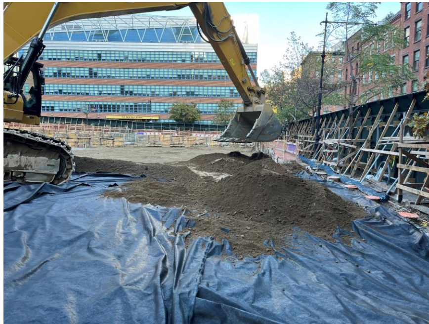
Photo 1: CCJV installing a temporary cover, consisting of imported general fill underlain by geotextile filter fabric, in the south-central part of the site (facing east)