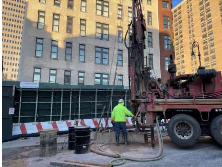
Photo 1: Craig advancing a geotechnical boring in the western part of the site (facing west)