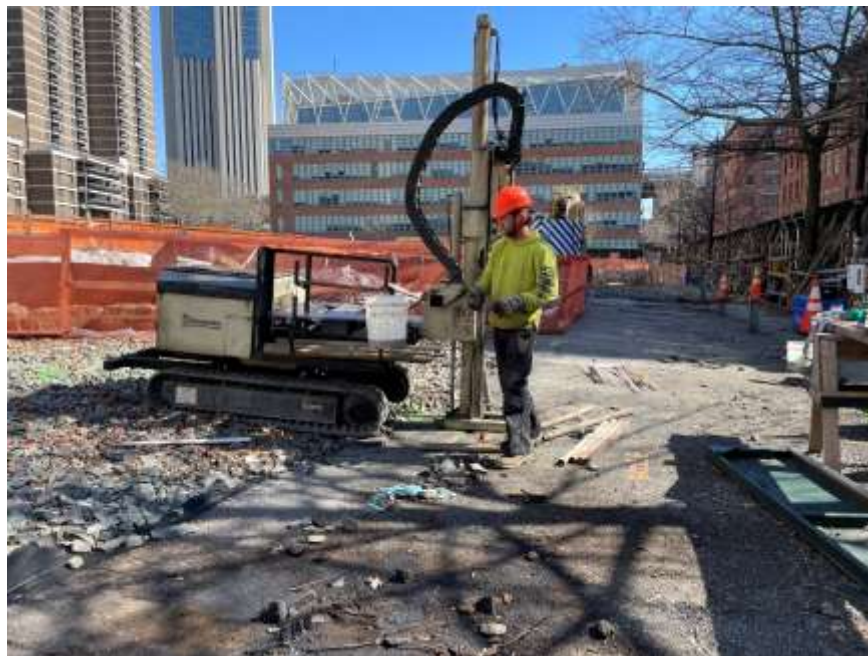
Photo 2: Lakewood advancing a soil boring in the southwestern part of the site (facing east)