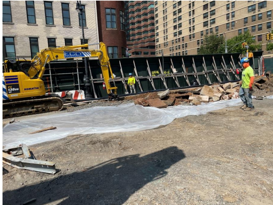
Photo 1: ECD excavating soil/fill along Beekman Street (facing northwest)