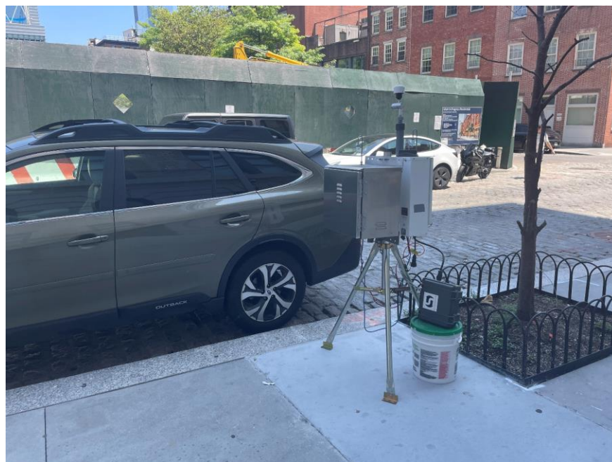
Photo 2: CAMP station WZ-1 on the western sidewalk of Beekman Street (facing southeast)