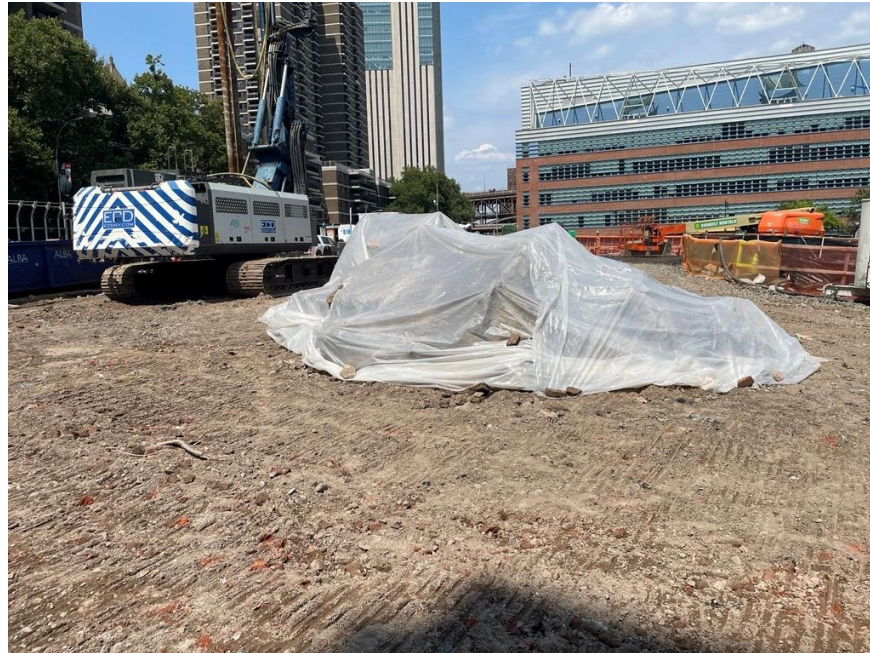
Photo 1: C&D stockpile on and covered with polyethylene sheeting in the northwestern part of the site (facing northeast)