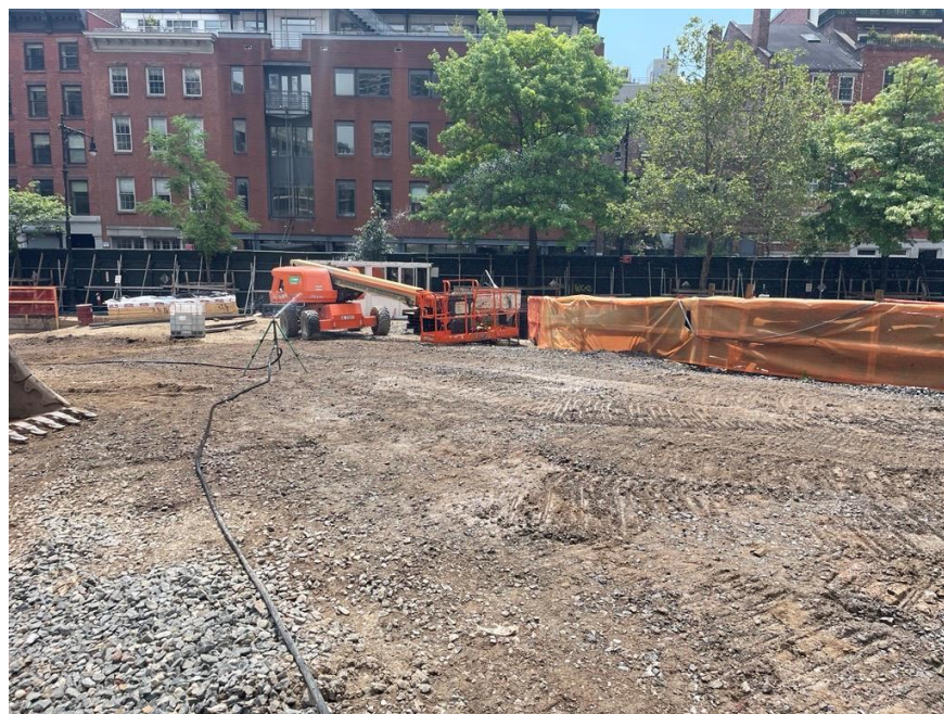
Photo 2: ECD implementing dust suppression in the central part of the site (facing south)