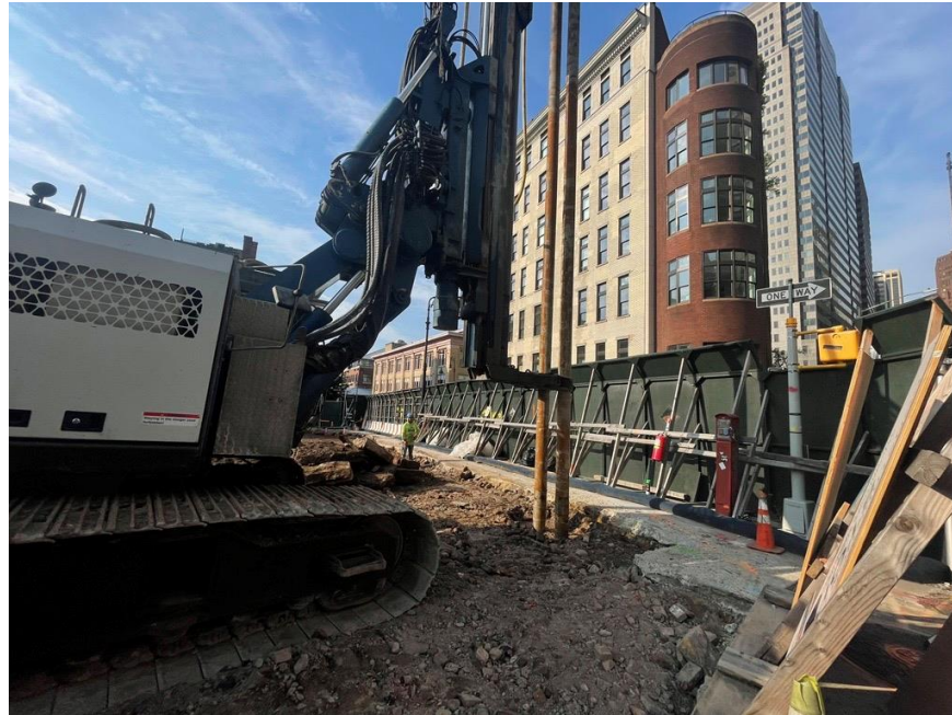
Photo 1: ECD advancing a borehole in the northwestern part of the site (facing southwest)