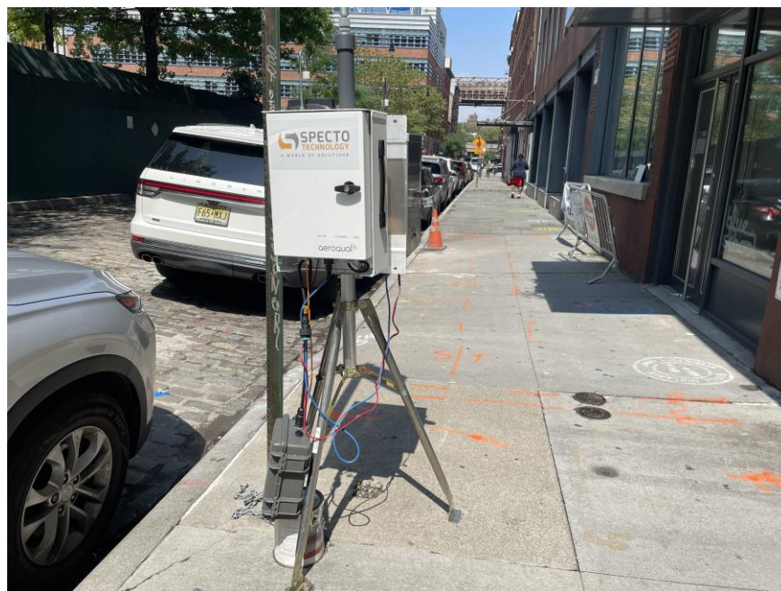
Photo 2: View of CAMP station WZ-2 on the southern sidewalk of Water Street (facing east)