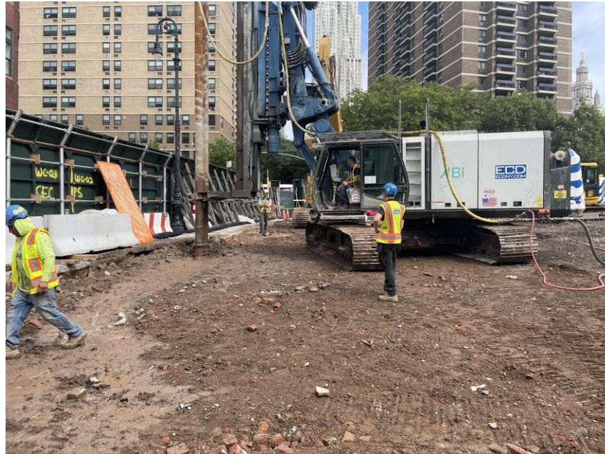
Photo 1: ECD advancing a borehole in the western part of the site (facing north)