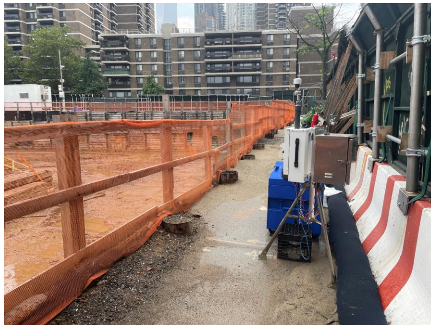
Photo 2: View of CAMP station PM-3 in the eastern part of the site (facing north)