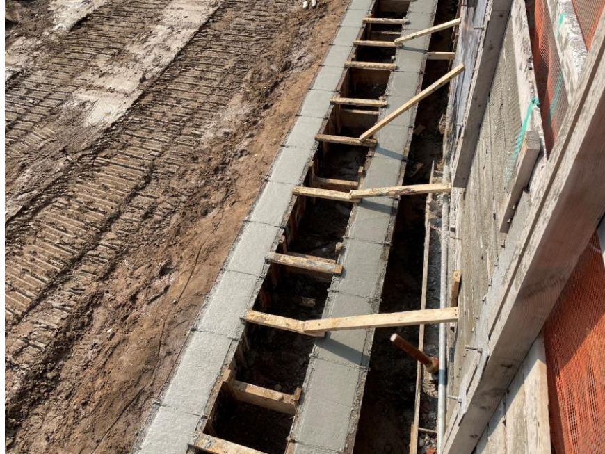
Photo 1: Concrete guide wall in the eastern part of the site (facing north)