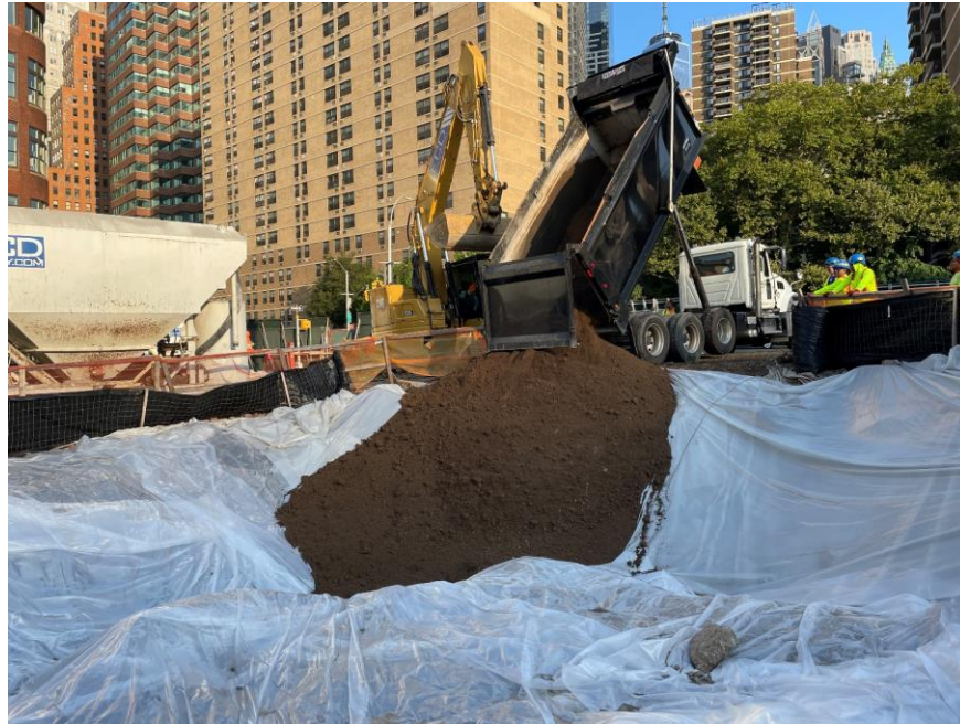
Photo 1: ECD importing general fill in the western part of the site (facing northwest)