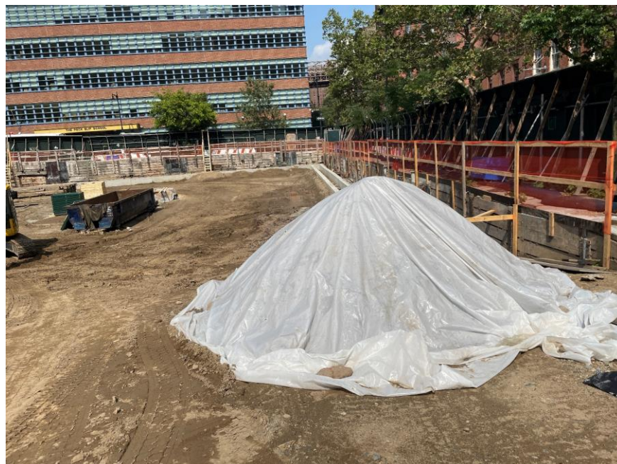
Photo 2: Soil/fill stockpile on and covered with polyethylene sheeting in the southern part of the site (facing east)