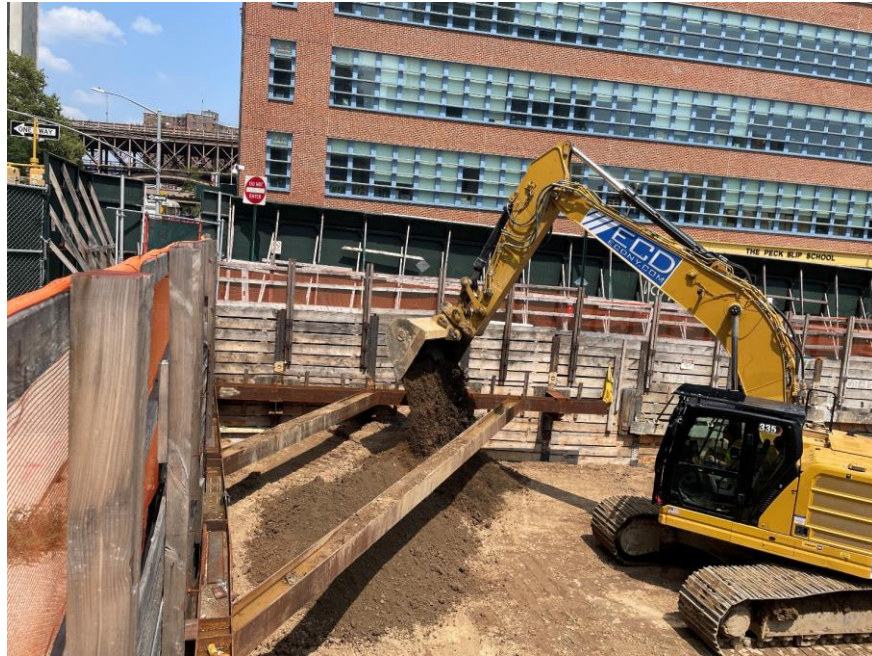
Photo 1: ECD using imported general fill to create a temporary ramp in the northeastern corner of the site (facing east)