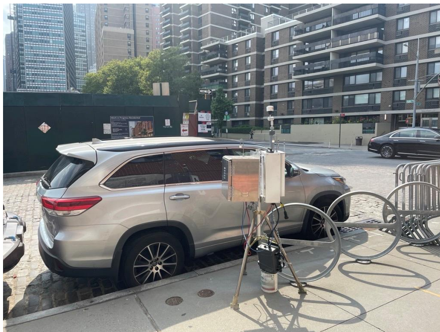
Photo 2: CAMP station WZ-3 on the eastern sidewalk of Peck Slip (facing northwest)