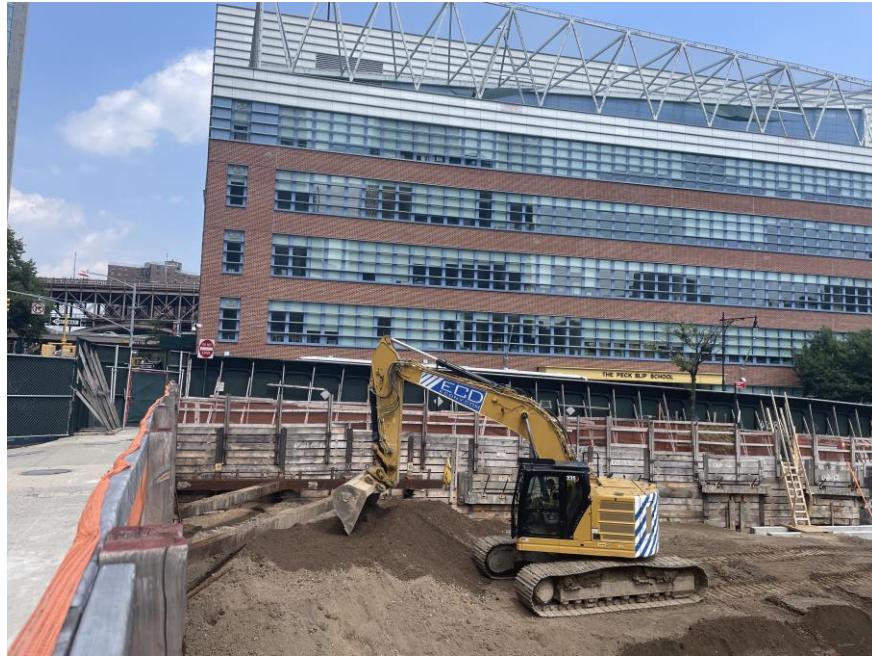
Photo 1: ECD using imported general fill to create a temporary ramp in the northeastern corner of the site (facing east)