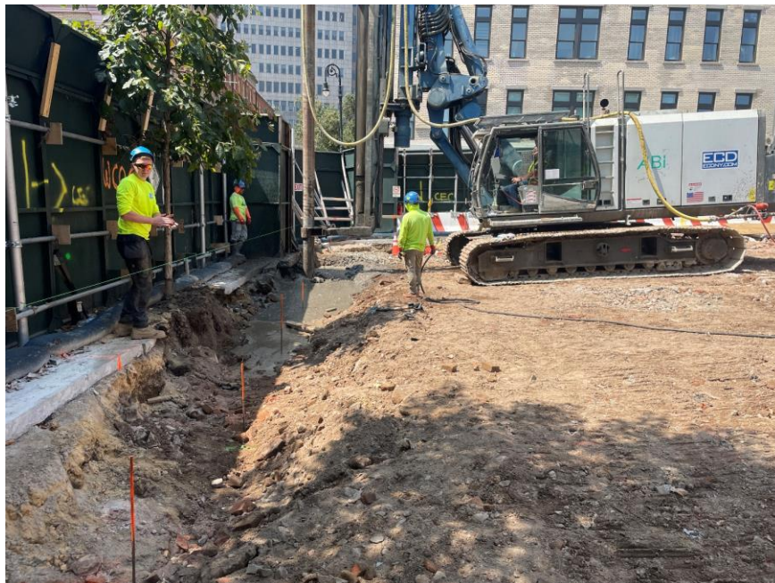
Photo 2: ECD advancing a soil mix column in the southwestern part of the site (facing west)