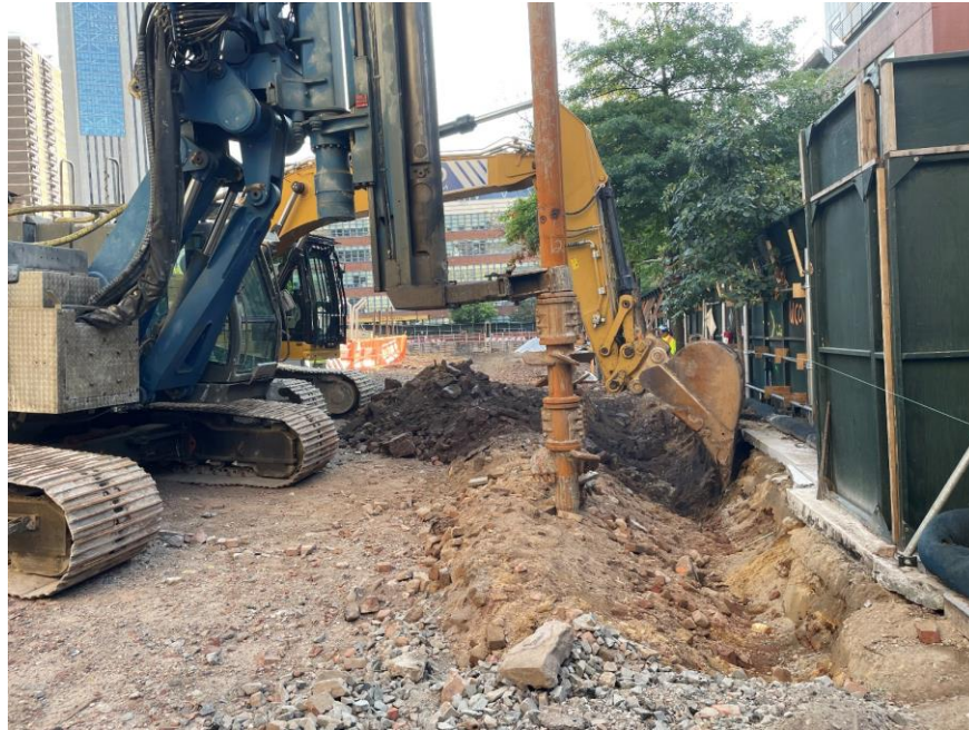
Photo 1: ECD excavating soil/fill in the southwestern part of the site in preparation for SOE installation (facing east)