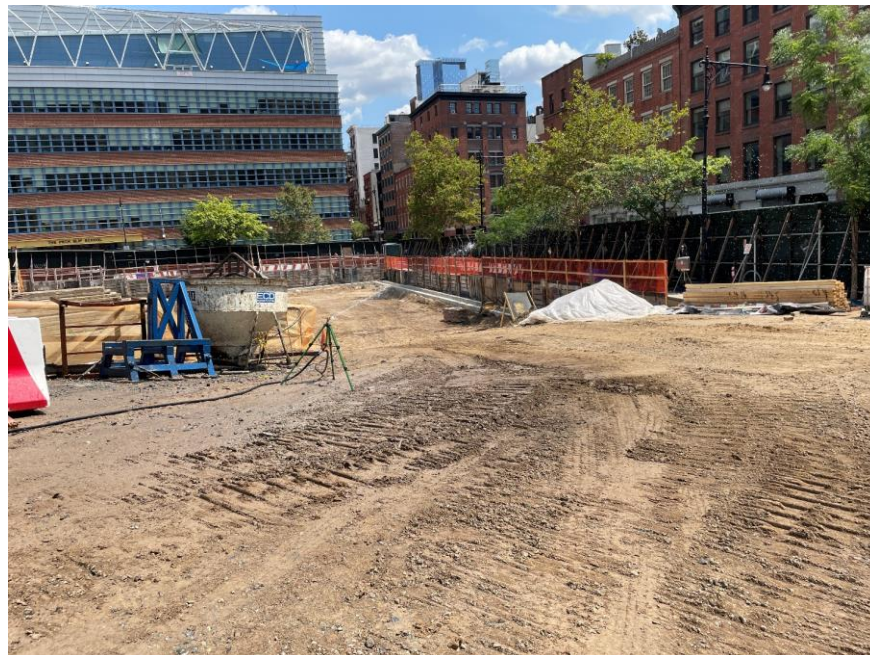
Photo 2: Dust suppression in the central part of the site (facing southeast)