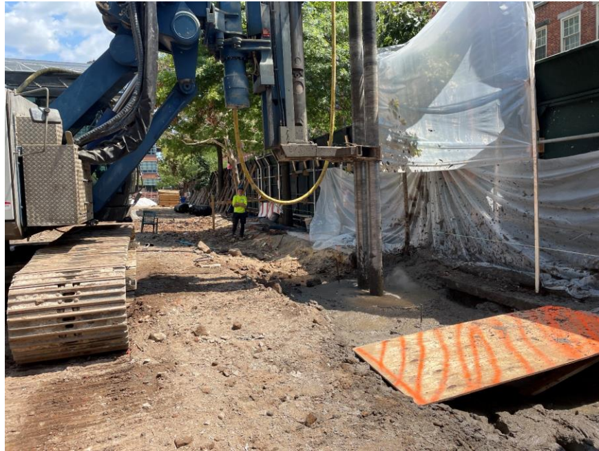
Photo 1: ECD advancing a soil mix column in the southwestern part of the site (facing southeast)