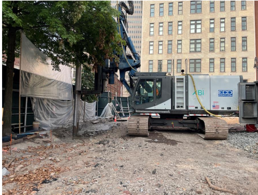
Photo 1: ECD advancing a soil mix column in the southwestern part of the site (facing southwest)