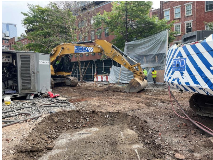
Photo 2: ECD grading soil/fill in the southwestern part of the site (facing southeast)