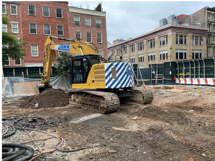
Photo 2: ECD excavating soil/fill in the southwestern part of the site (facing southwest)