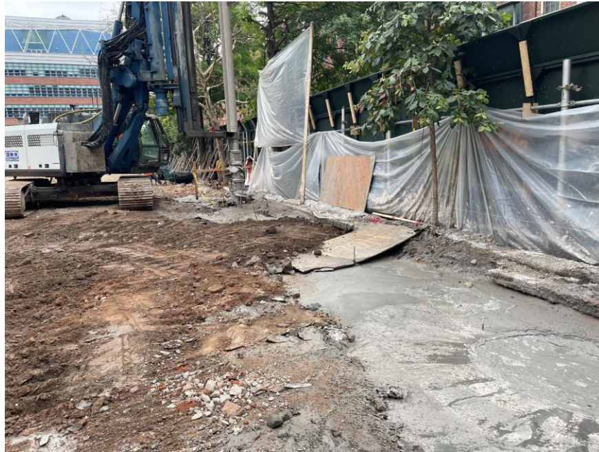
Photo 1: ECD advancing a soil mix column in the southwestern part of the site (facing southeast)