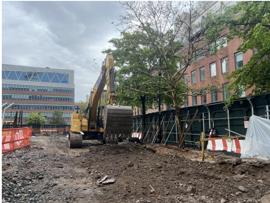
Photo 2: ECD grading soil/fill in the southwest part of the site (facing southeast)