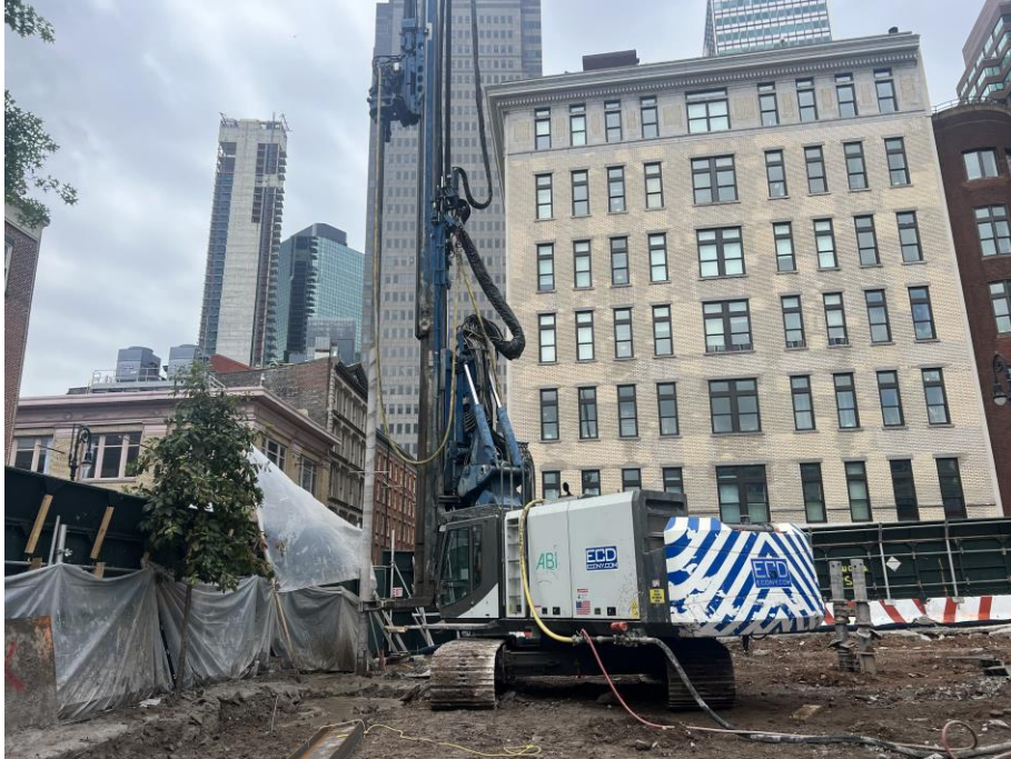
Photo 1: ECD advancing a soil mix column in the southwest part of the site (facing southwest)